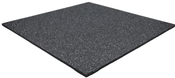
20mm Rubber Tile